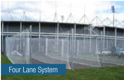
Four Lane System