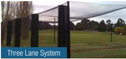
Three Lane System