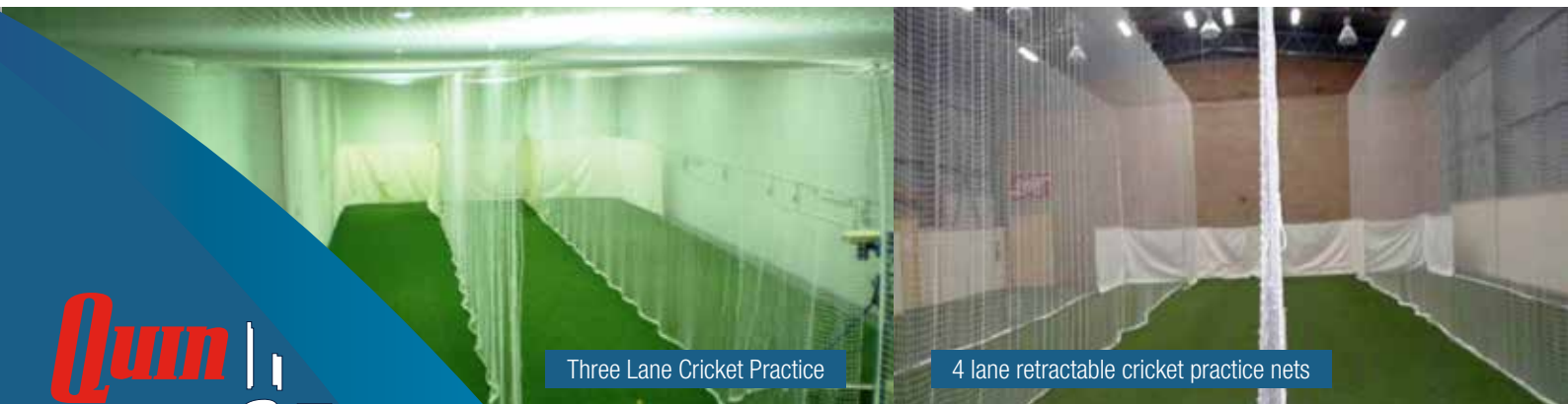
Three Lane Cricket Practice

Our polyester lane screens are used in areas where there is the most wear to protect nets from constant impact of balls. The material is very strong and will last many years in the